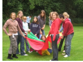
Fun in Clare Park.