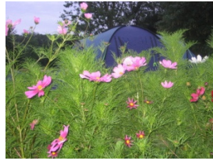
Camping @ the Irwins.