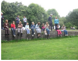
At Clare after leading worship.