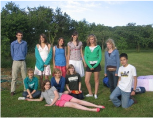
In the Irwins' garden