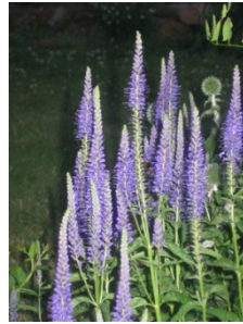
Flowers @ the Irwins.