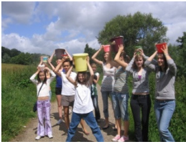
Explorers carrying water round Hadleigh